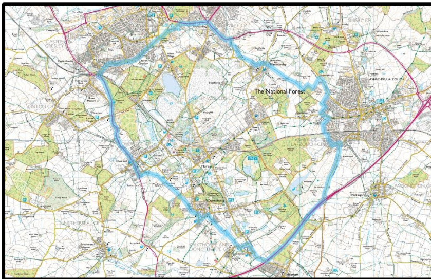
Fig. 1 Heart of the Forest boundary

The Heart of the Forest is an area of 10 square miles in the coalfield area of South Derbyshire and North West Leicestershire. Its exceptional story is one of rapid change from 19 th century extractive industries to a 21 st century sustainable landscape led by the creation of The National Forest.